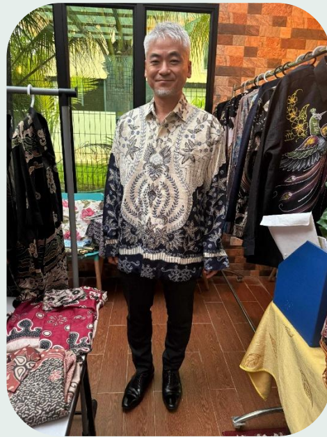
Wow! Very innovative design

Although I couldn't tell them apart, she could recognize which colour is Indonesian-like or Malaysian-like. Together with a dinner at a local market, those are good memories and souvenirs of my Brunei Darussalam trip.