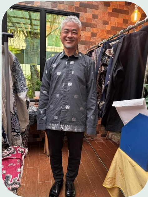
This Batik is truly a Brunei design

She took me many places, but I particularly enjoyed the batik boutique. She let me try many designs and I felt like an old model. She told me that this one has a traditional Brunei design and it was really nice.